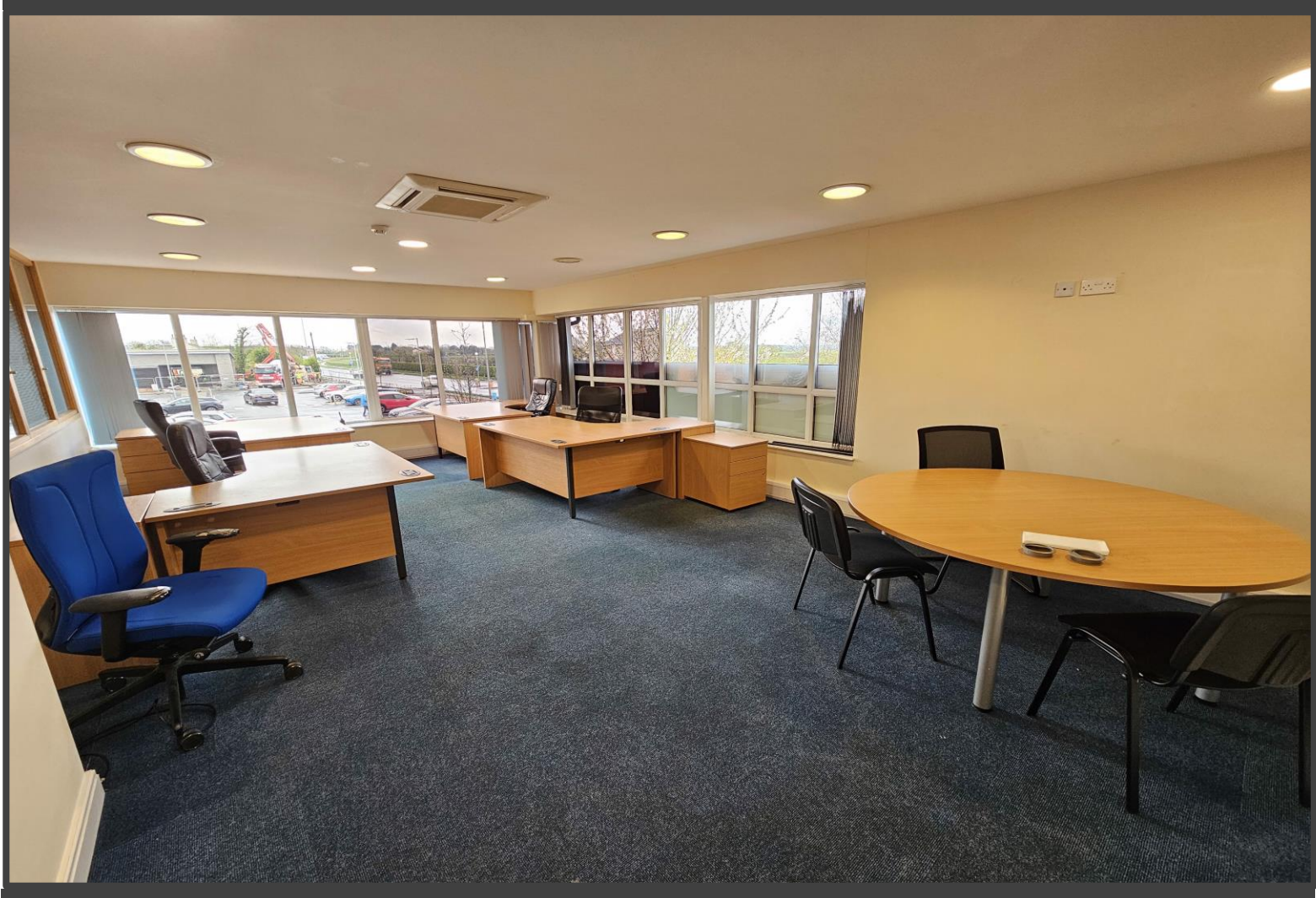
Asking Price Monthly Rental Of £550